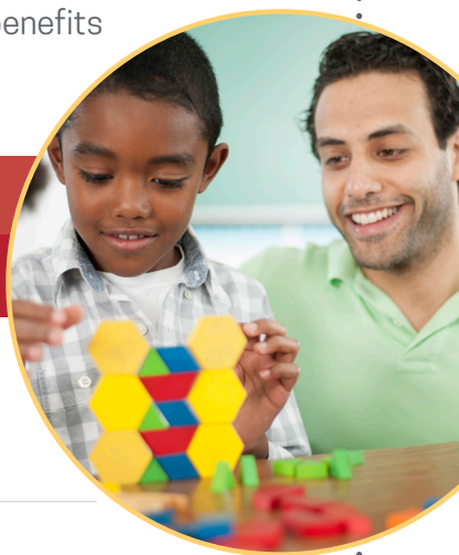
St. James Children's Center (0 to 100 capacity) Center Self-Study

See how St. James Center succeeded by engaging with CA: